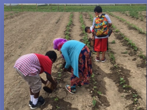
Slate Run Living Historical Farm