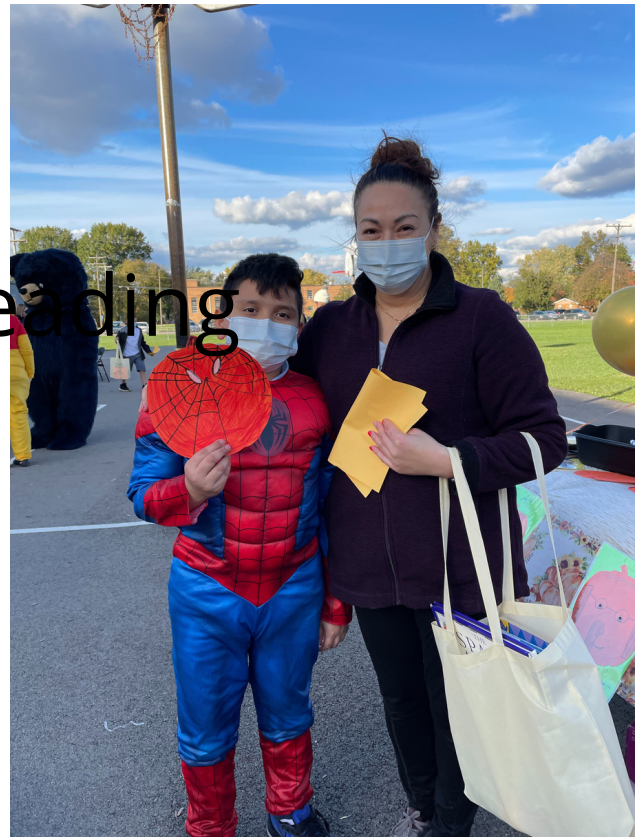
Students and parents dress up, make art, and take home new books during the NL Fall Literacy Festival