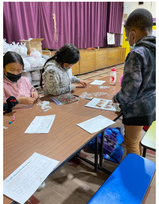
4th Grade Students Create Bracelets for a Seeds of Caring Project