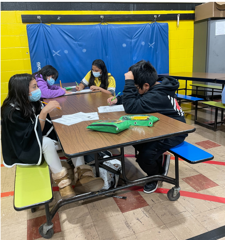
Fifth Graders Work Hard at Their Table During Power Hour Homework Time